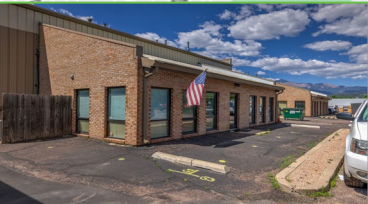
155 Mount View Lane